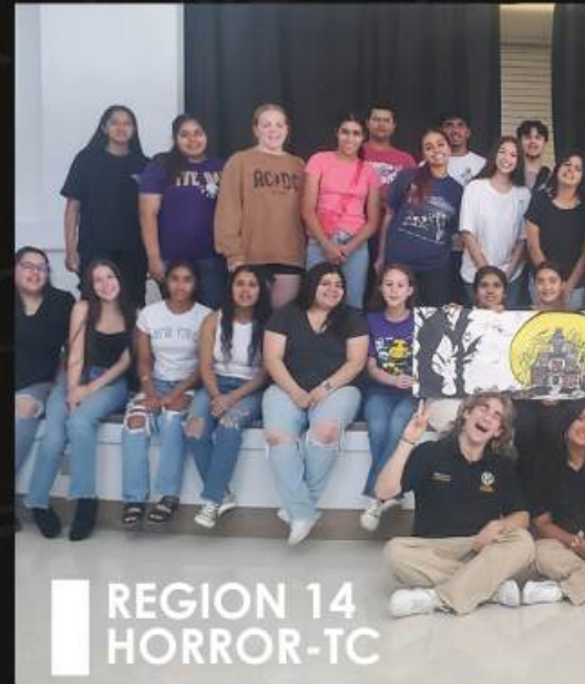
REGION 14 HORROR-TC