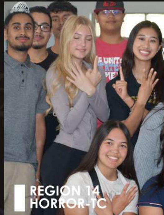
REGION 14 HORROR-TC