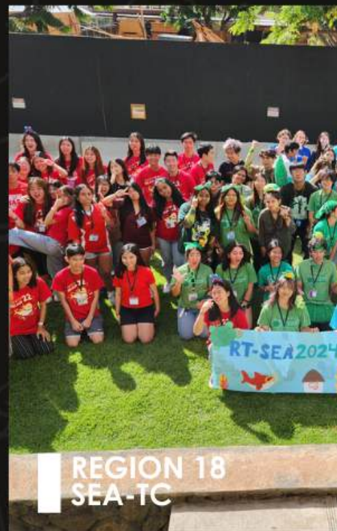
REGION 18 SEA-TC