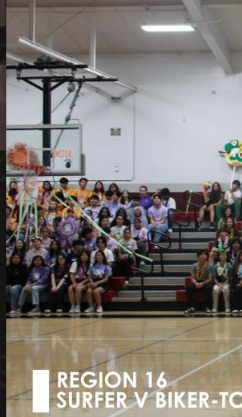
REGION 16 SURFER V BIKER-TC