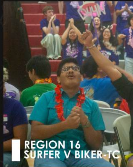
REGION 16 SURFER V BIKER-TC

Attending Region 16's Surfer vs. Bike-RTC was an amazing experience and definitely one of my favorite Key Club memories! As the official guest, it was an honor to attend on behalf of the CNH District and participate in such an exciting event. Whether it was during workshop icebreakers or the talent show, from the moment I arrived, I was so inspired by the enthusiasm for service and community I felt from every single member.