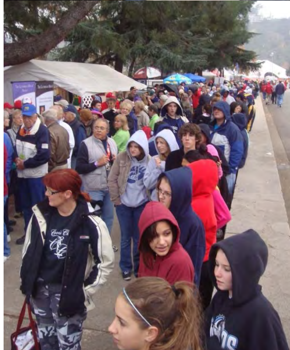
Picture: Top – Hoover Key Club Members are Rose Floats cutting flowers. Bottom – Everyone waiting outside to go and work on the floats.