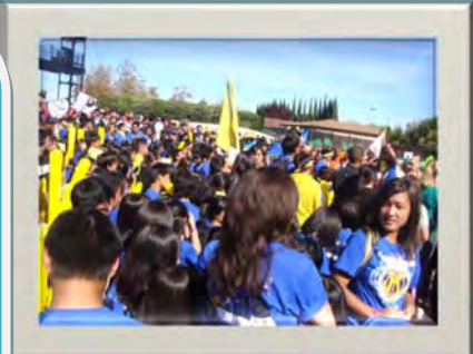
NOVEMBER EDITION ISSUE VIII - VOLUME V