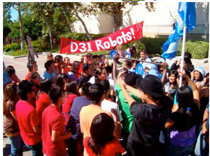
Division 11 Defeating Division 31 in Spirit