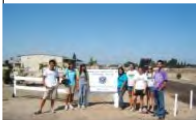
Group picture at Happy Trails