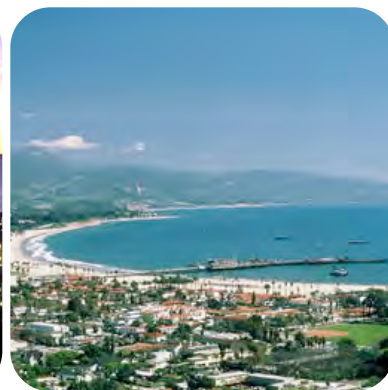
Santa Barbara, CA?

To be perfectly frank, we Lieutenant Governors are not exactly sure as to where we will be holding our RTC. Chances are that it will be held within the area of Ventura/Santa Barbara. I'll keep you posted!