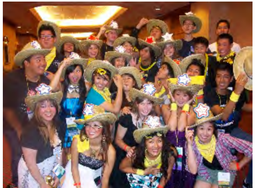
CNH Key Clubbers prepare for SAA duty at ICON '09

LTG Letter.....1 ICON Photo.....1 ***** Back-to-School.....2 Fall Rally.....2 Recognition.....2