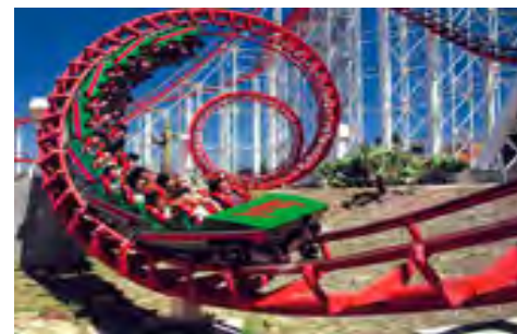
Viper 6 Flags Magic Mountain