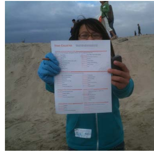
Service Project R: Reduce Global Warming

Beach clean ups are one of the easiest ways to clean up your environment. It can also be at a local park or some simple gardening. All in all, we are saving our world!